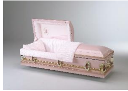
18 Gauge Metal