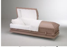
20 Gauge Metal